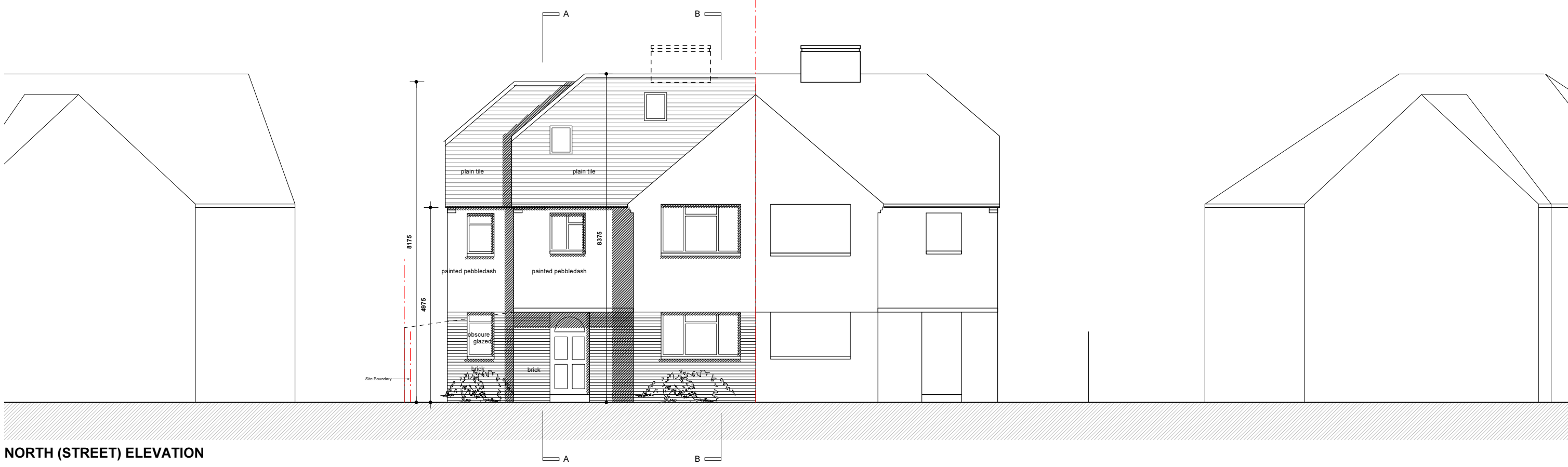
NORTH (STREET) ELEVATION